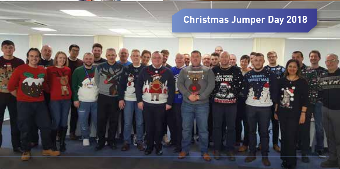
Christmas Jumper Day 2018