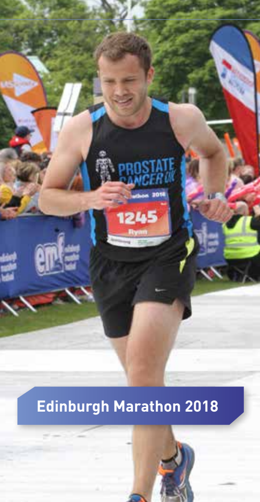
Edinburgh Marathon 2018