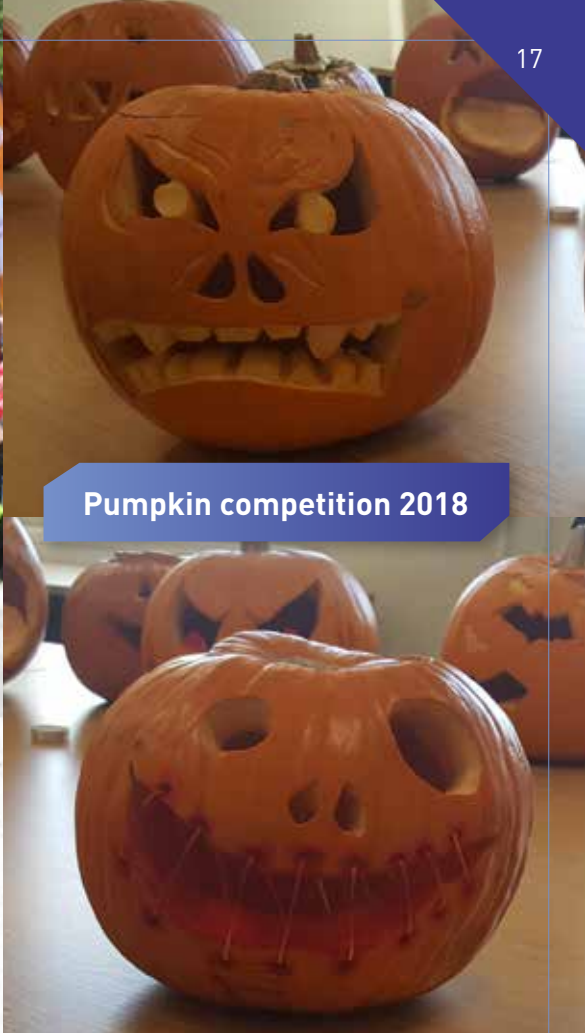
Pumpkin competition 2018