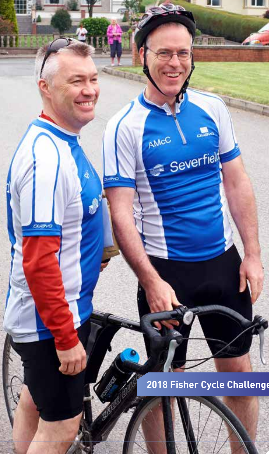
2018 Fisher Cycle Challenge