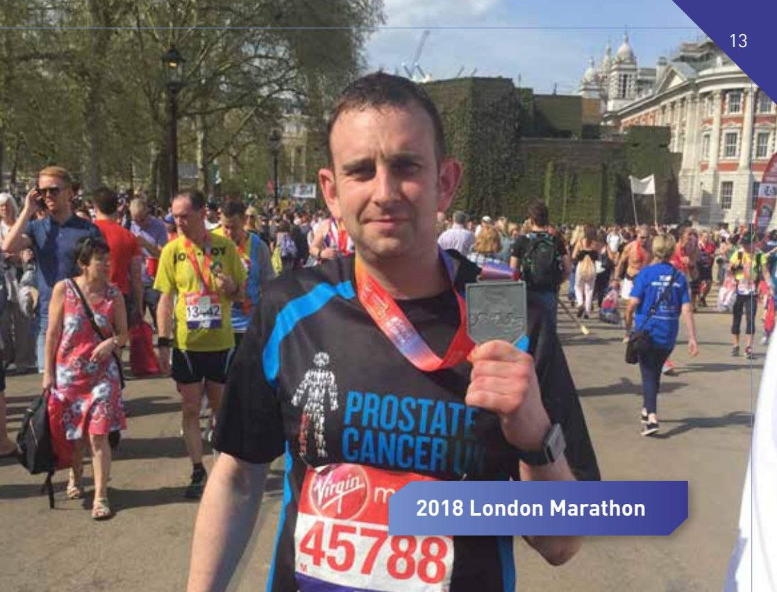
2018 London Marathon